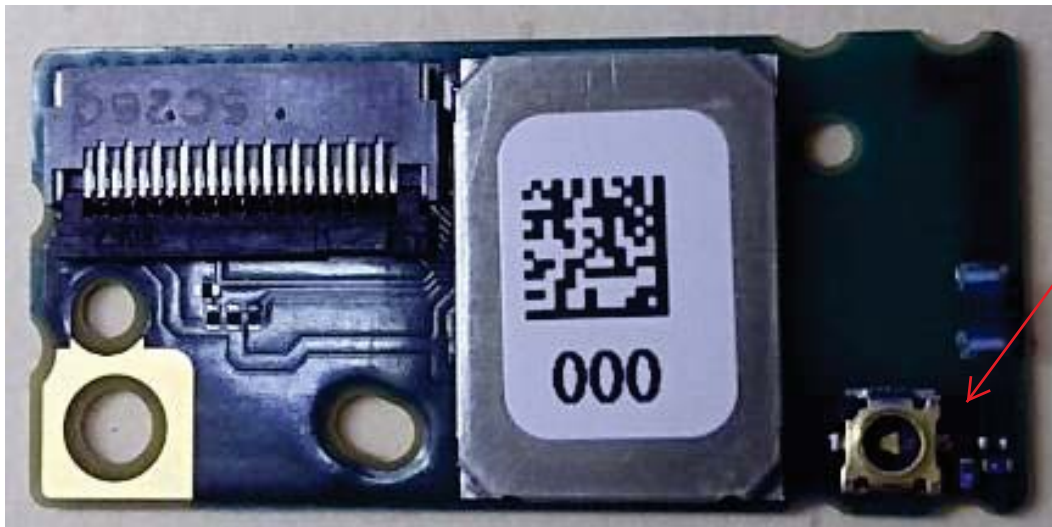
(Monopole pattern antenna)