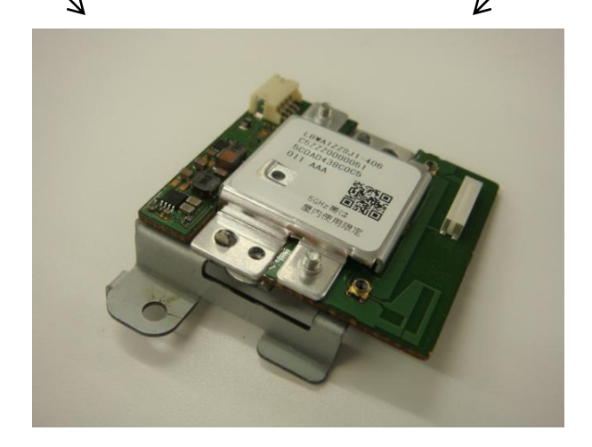
Mount a module on an attachment. After that, a module is fixed to an attachment by screw.