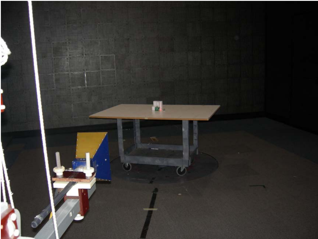
Figure 3: Test Setup – Radiated Emissions – Unintentional