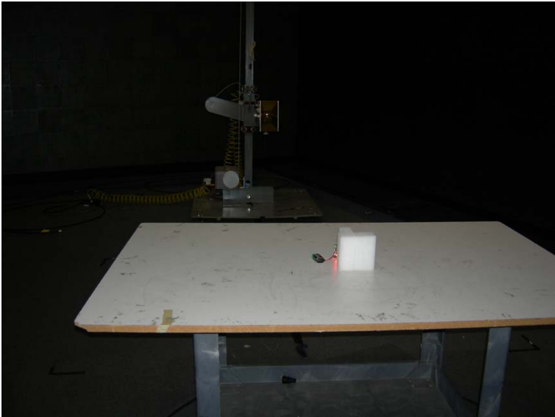
Figure 4: Test Setup – Radiated Emissions – Unintentional