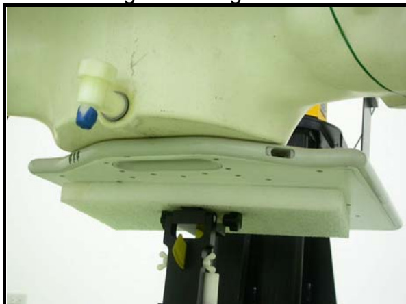
A. The front of the EUT face to the phantom with 0mm-separation distance.

The following test configurations have been applied in this test report: