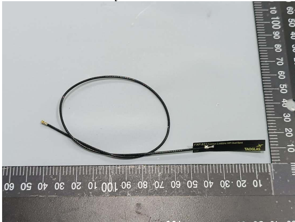
Accessory: FXP831.07.0100C Pic 2