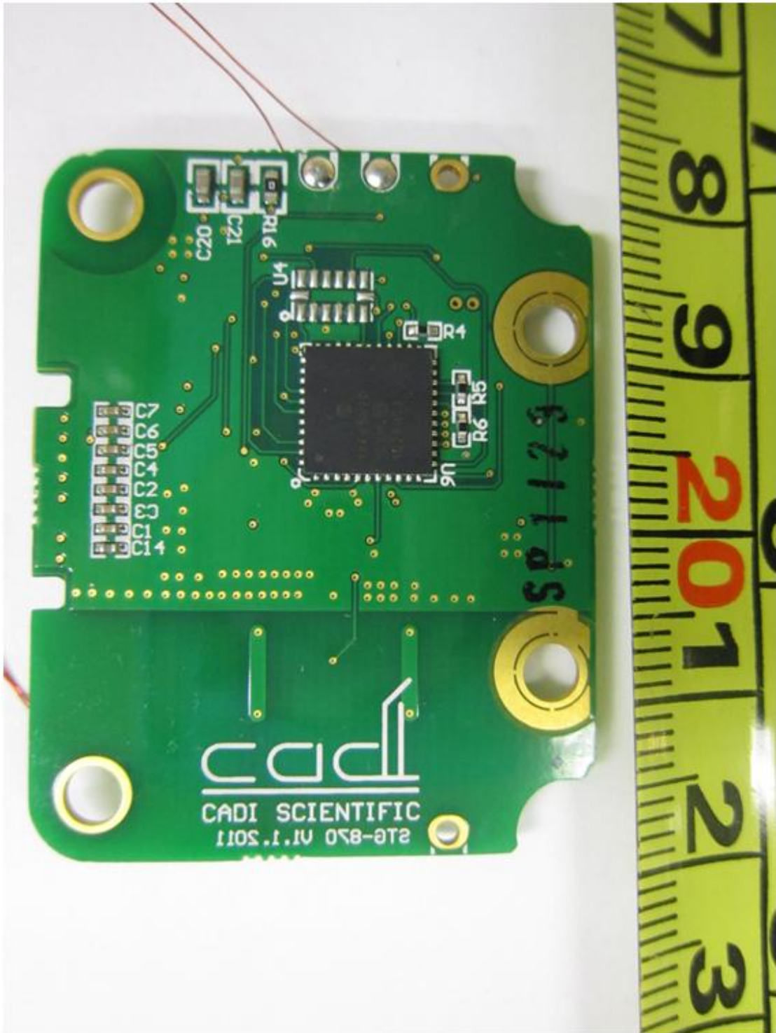
Main-Board PCB Trace Side