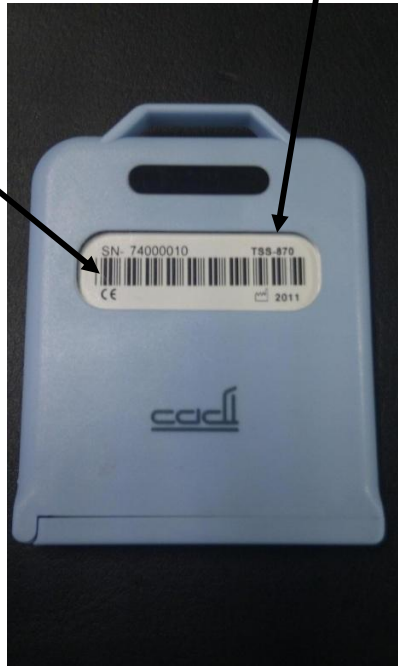
Physical Location of FCC Label on EUT