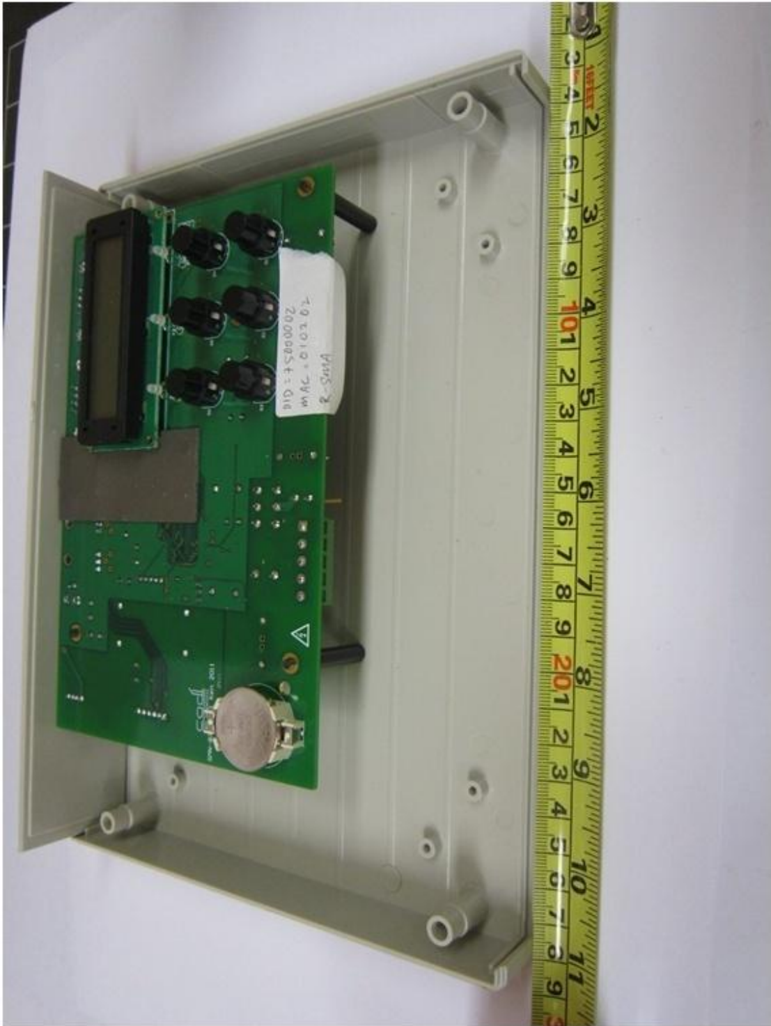
EUT Internal View