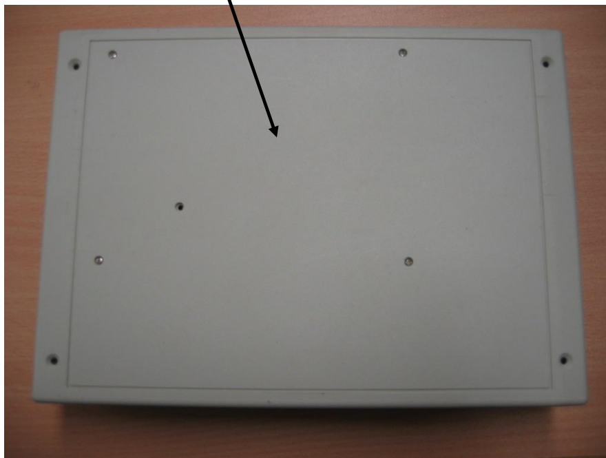
Physical Location of FCC Label on EUT