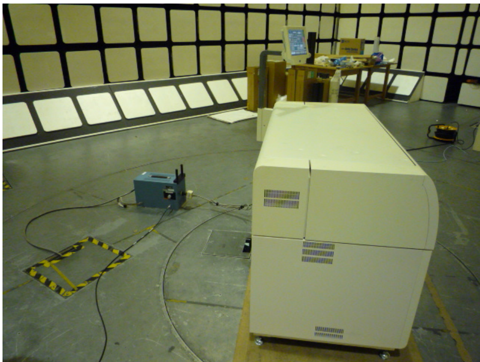
- Side View -

Photograph present configuration with maximum emission