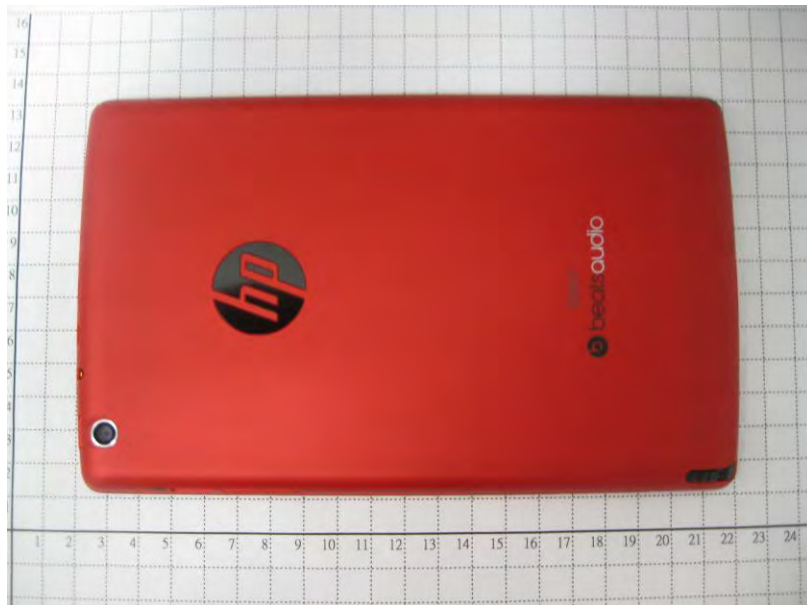
Fig.5 Back view of EUT

Unless otherwise stated the results shown in this test report refer only to the sample(s) tested and such sample(s) are retained for 90 days only.