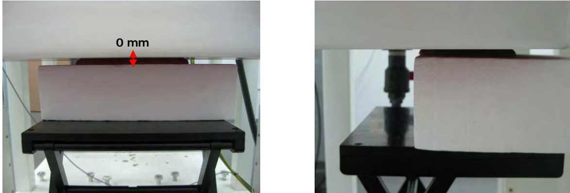
Fig.3 EUT back side mode to flat phantom

Unless otherwise stated the results shown in this test report refer only to the sample(s) tested and such sample(s) are retained for 90 days only.