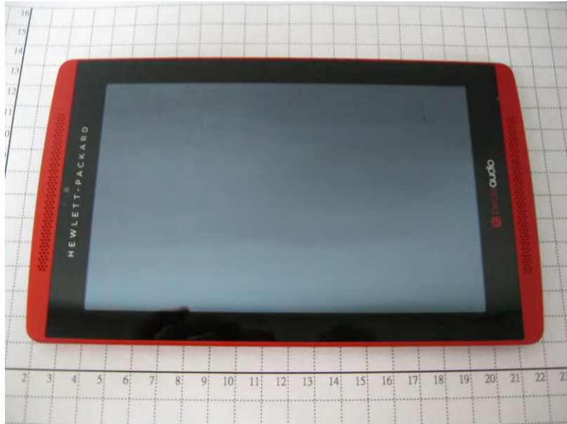
Fig.4 Front view of EUT