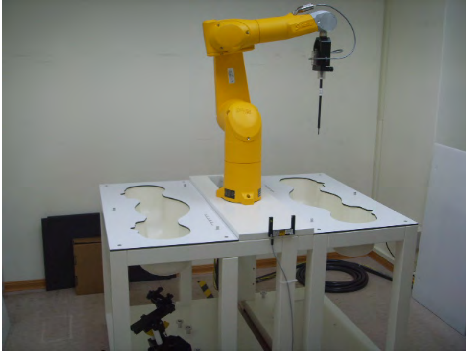
Fig.1 Photograph of the SAR measurement system

Unless otherwise stated the results shown in this test report refer only to the sample(s) tested and such sample(s) are retained for 90 days only.