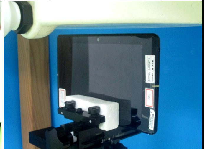
Top Side of EUT with 9 mm Gap