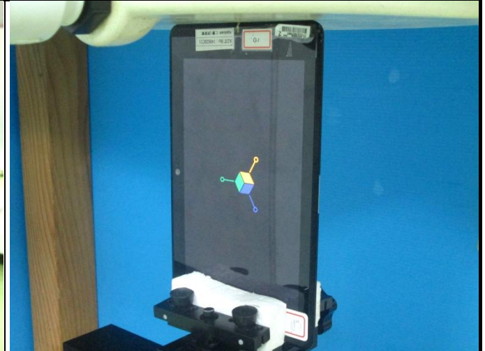
Right Side of EUT with 0 mm Gap