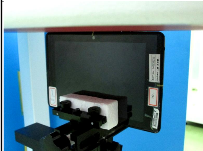
Top Side of EUT with 0 mm Gap