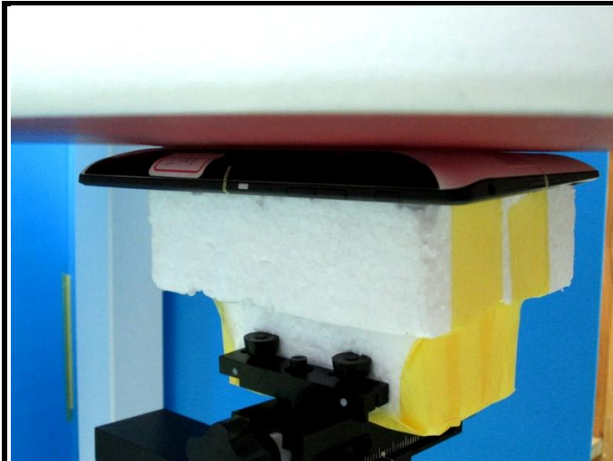
Rear Face of EUT with 0 mm Gap