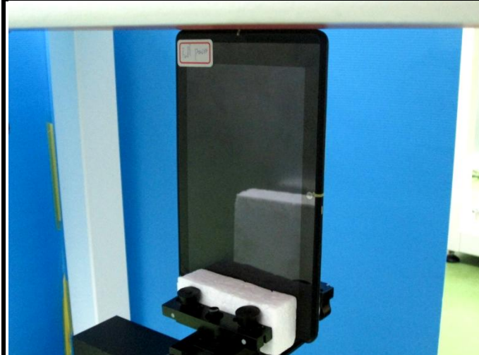
Left Side of EUT with 0 mm Gap