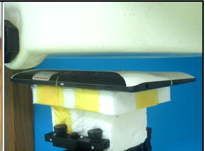
Rear Face of EUT with 16 mm Gap