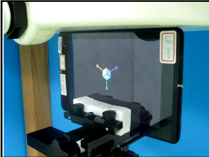
Bottom Side of EUT with 0 mm Gap