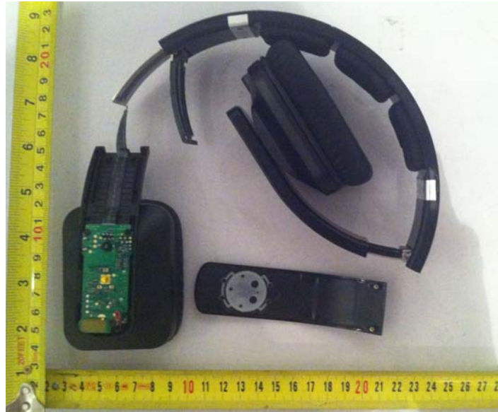
EUT –PCB View