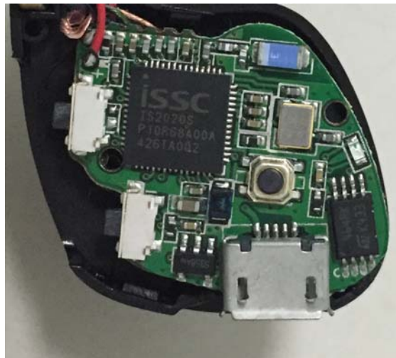
EUT –Battery View