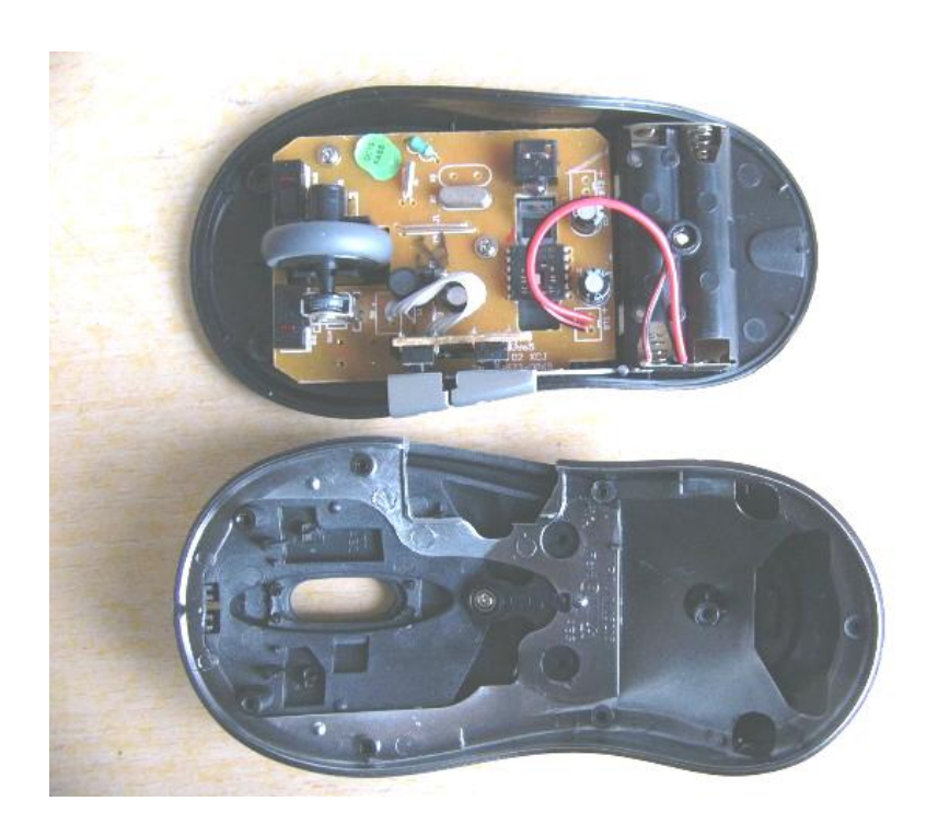
Main board component side