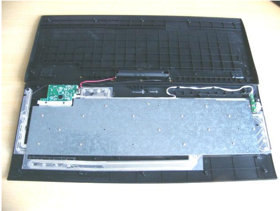
Main board component side