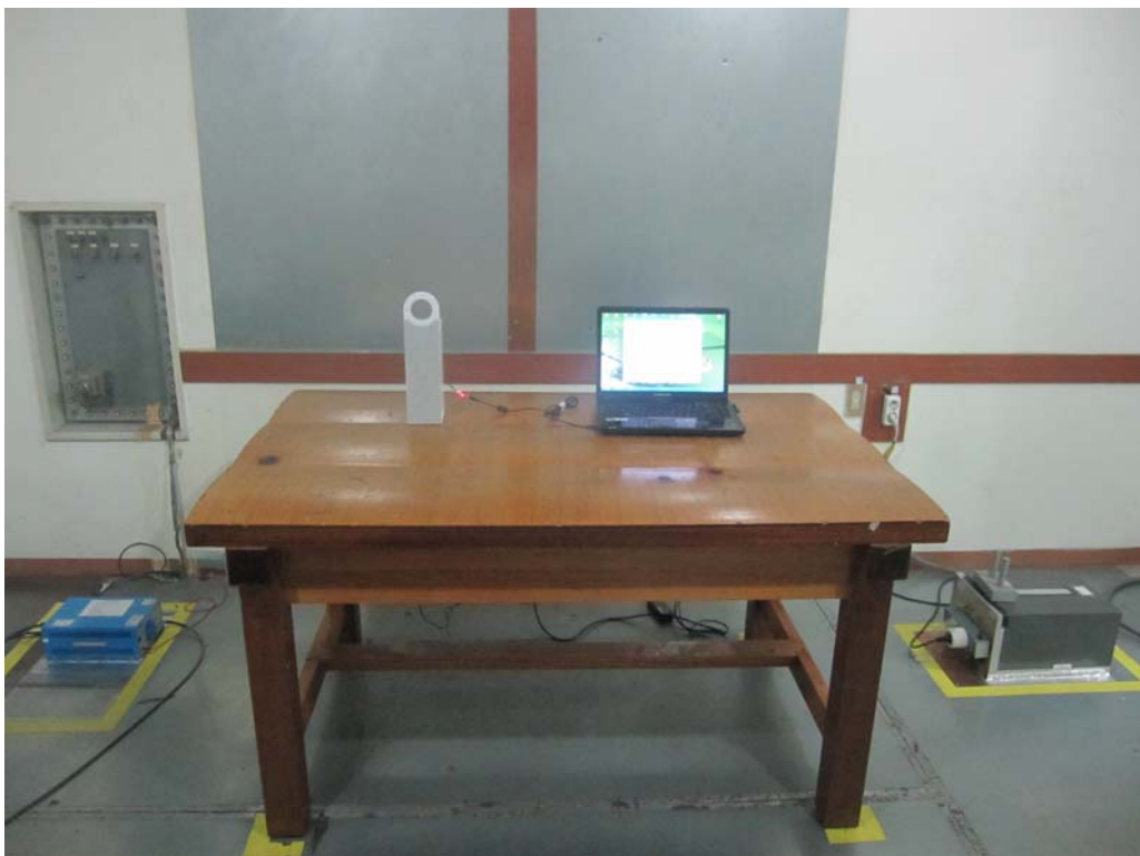
AC Power Conducted measurements