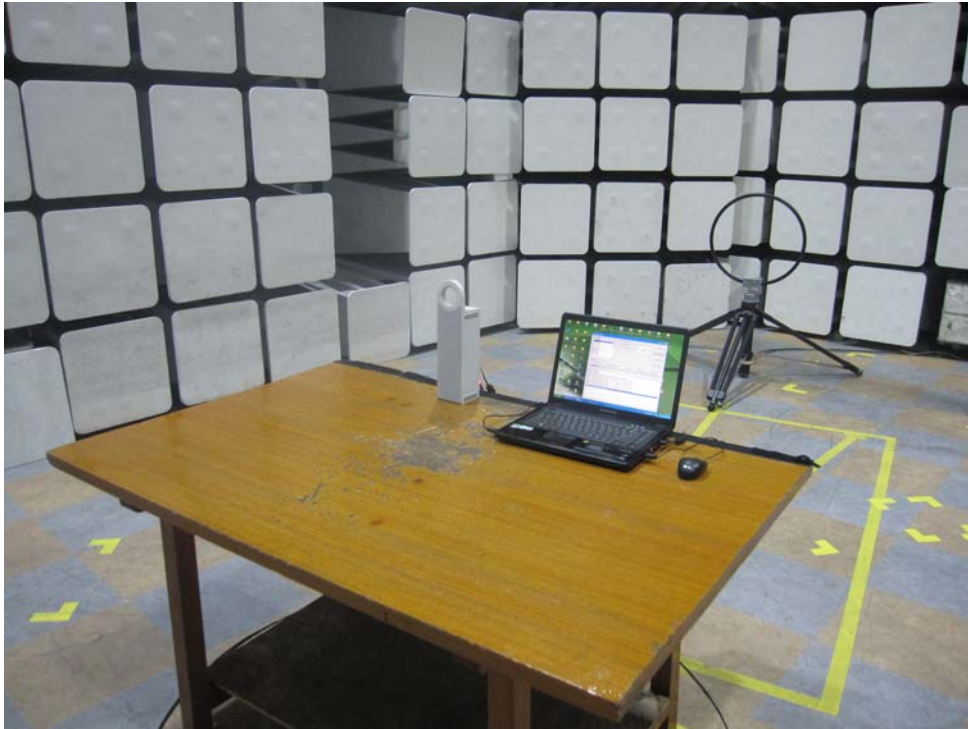
Radiated RF measurement (Below 30 MHz)