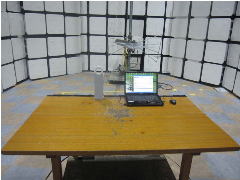
Radiated RF measurement (Below 1 GHz)