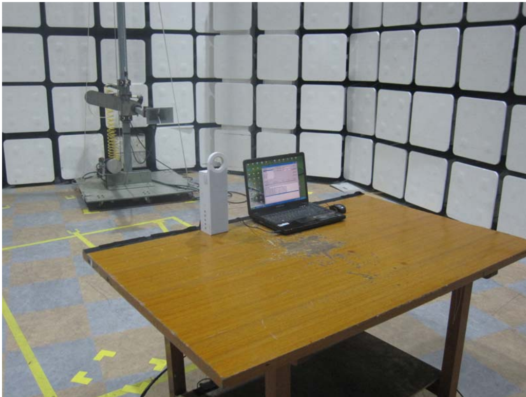
Radiated RF measurement (Above 1 GHz)