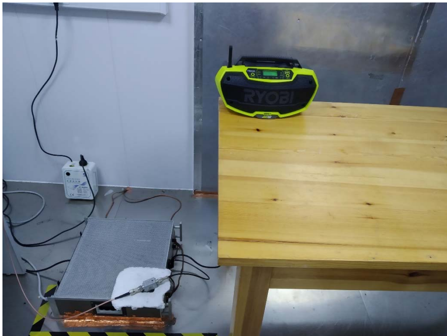
Test Photo 1