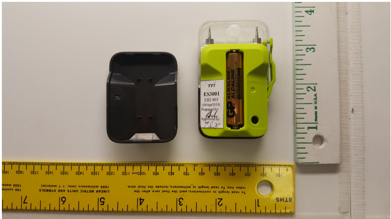
REAR VIEW WITH BACK COVER REMOVED