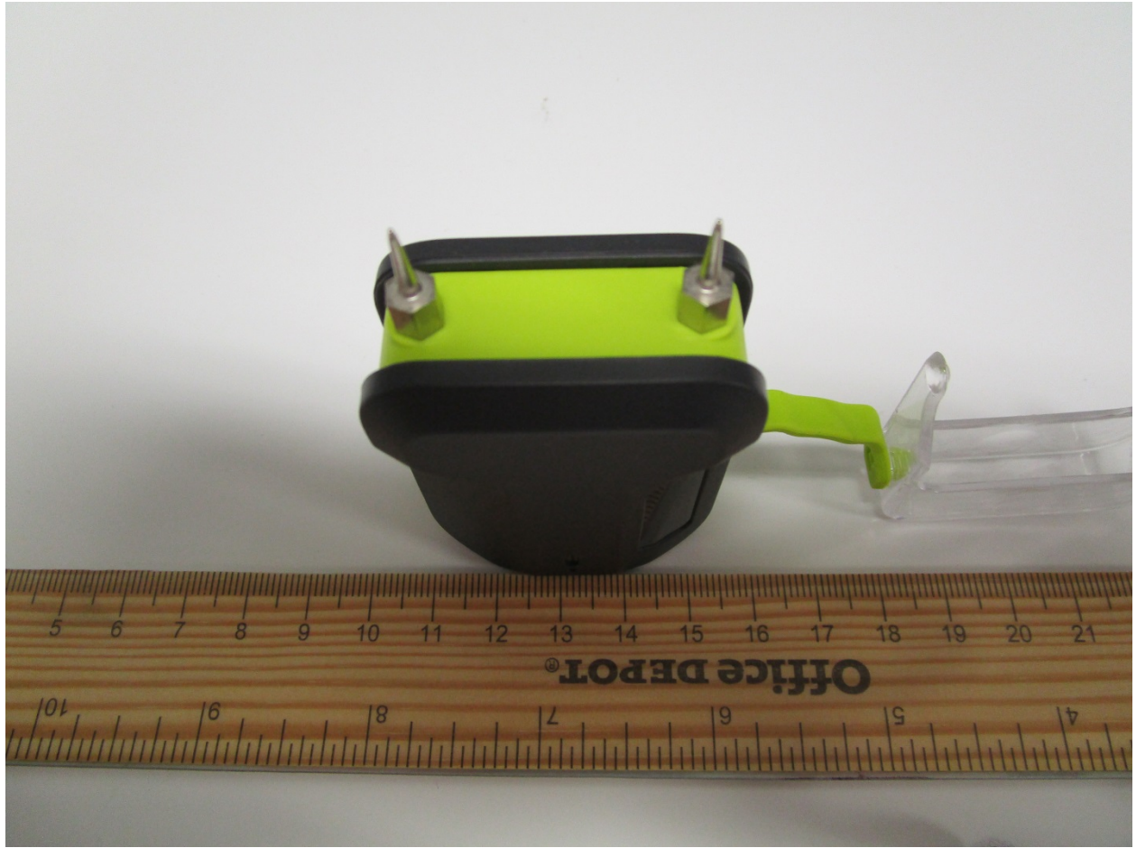
TOP VIEW WITHOUT COVER