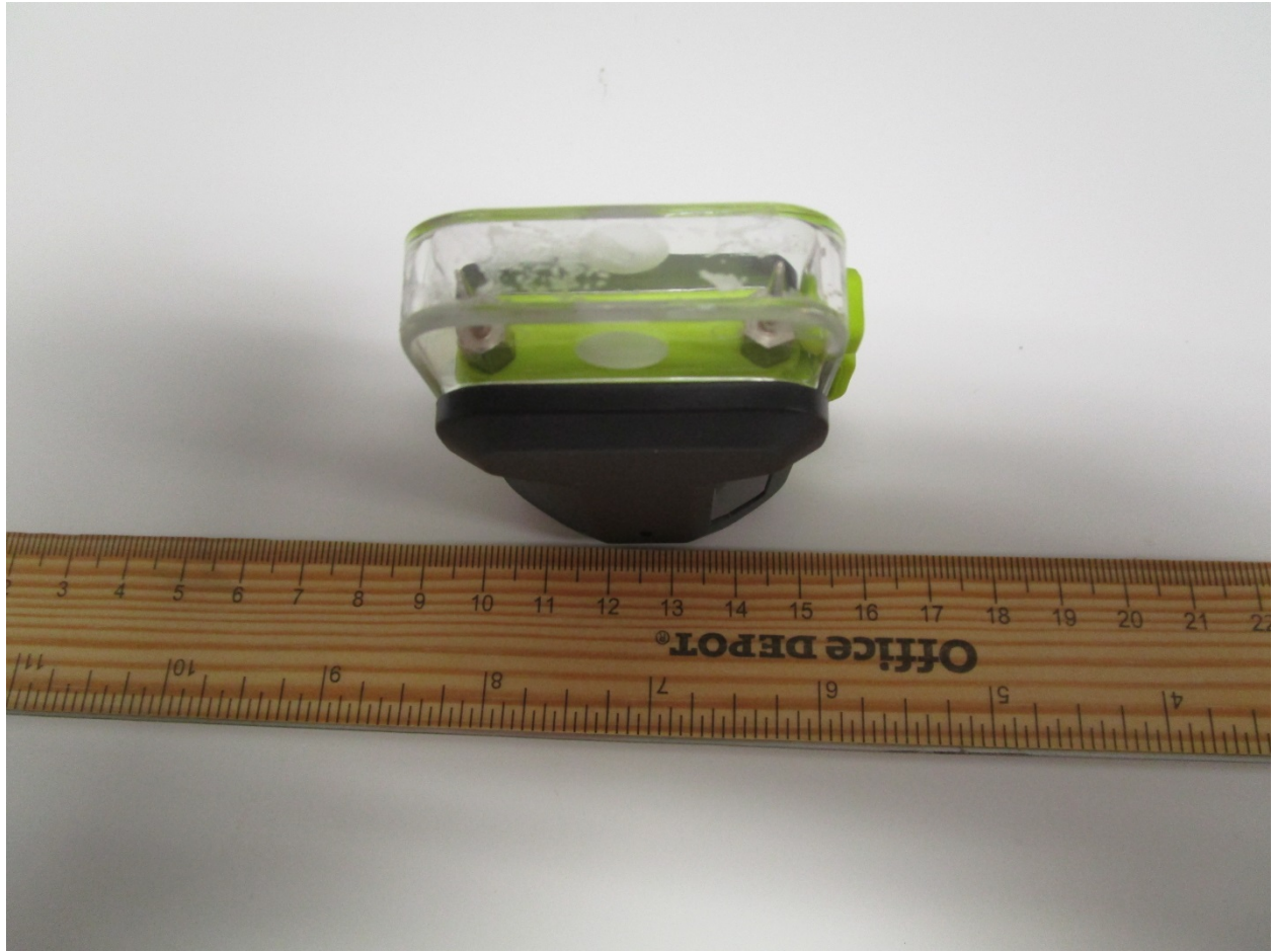
TOP VIEW WITH COVER