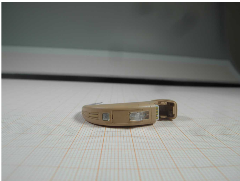
T Max SP