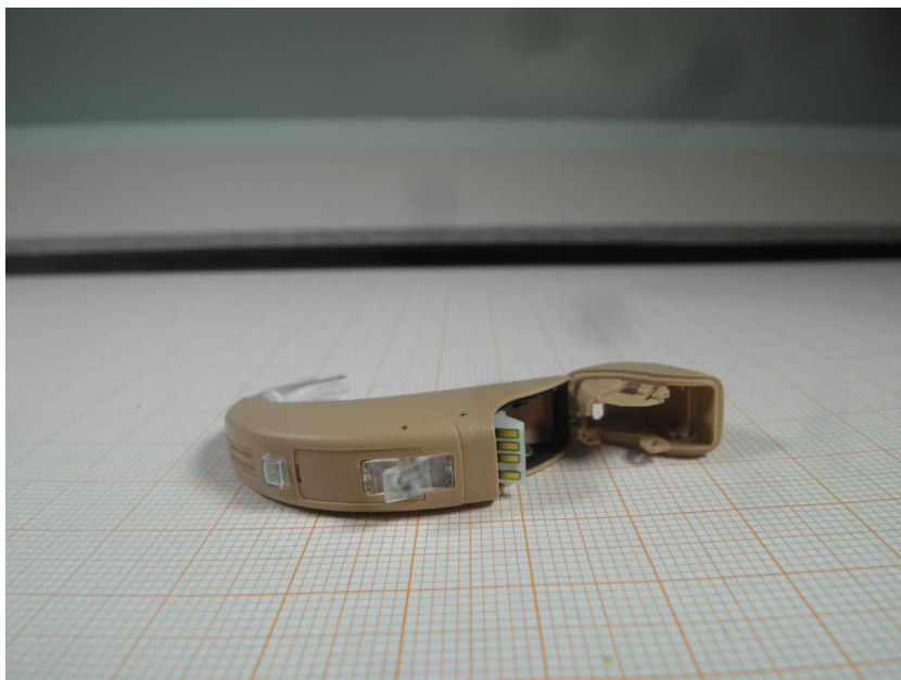
T Max SP