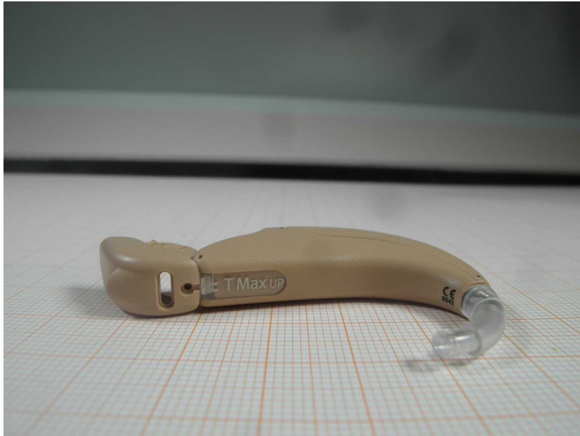
T Max UP