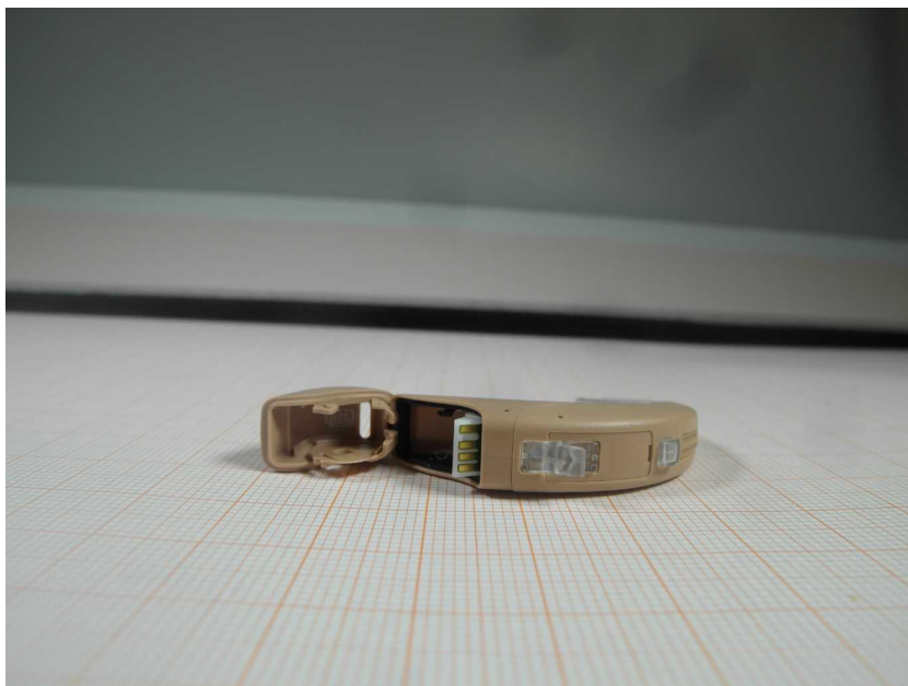
T Max UP