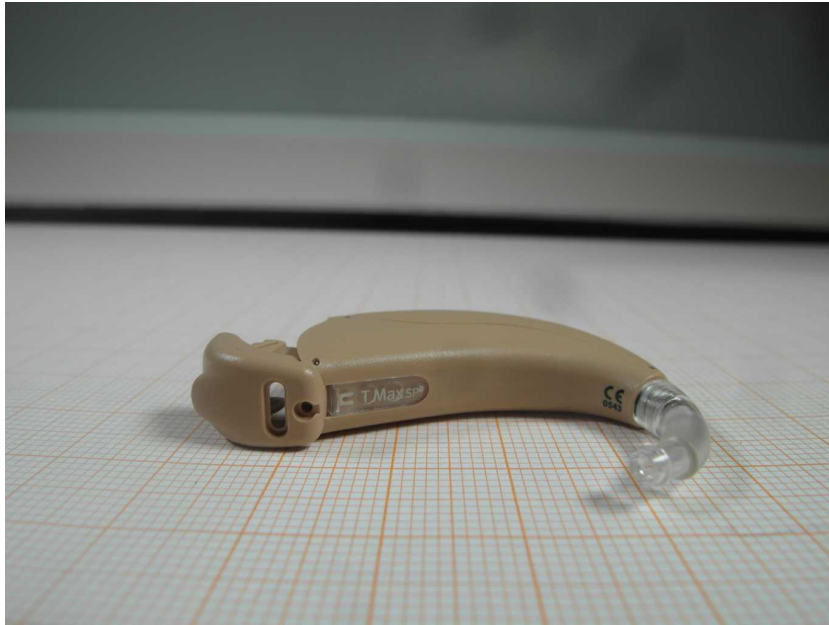
T Max SP