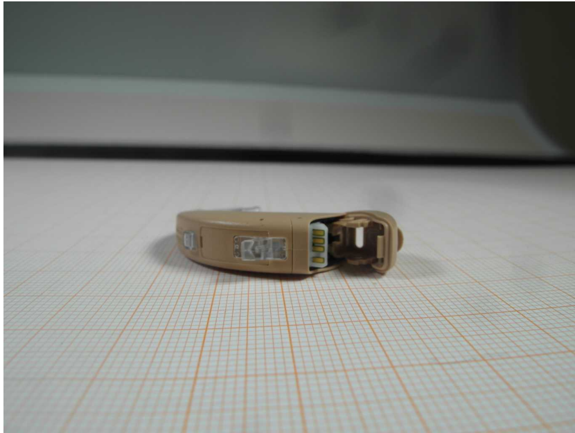
T Max SP