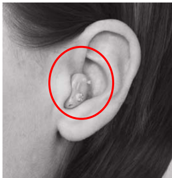
Figure 1: Position of the Hearing Instrument on the User

Pursuant to paragraph §2.925 of 47 C.F.R. the hearing instrument Unitron Passport ITE, which is subject of this filing, shall bear a permanently affixed, readily visible label listing the information as specified in §2.926 and §15.19(a) of the 47 C.F.R. Due to the specific use of the hearing instrument (as shown in figure 1) its external surface is in contact with the user's skin in the ear canal.