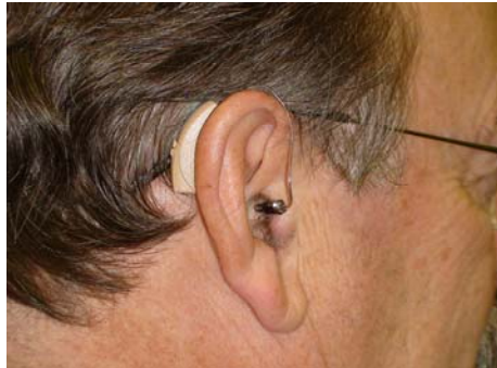
Figure 1: Position of the Hearing Instrument on the User

Pursuant to paragraph §2.925 of 47 C.F.R. the hearing instrument Unitron Passport BTE, which is subject of this filing, shall bear a permanently affixed, readily visible label listing the information as specified in §2.926 and §15.19(a) of the 47 C.F.R. Due to the specific use of the hearing instrument (as shown in figure 1) its external surface is in contact with the user's skin behind the ear.