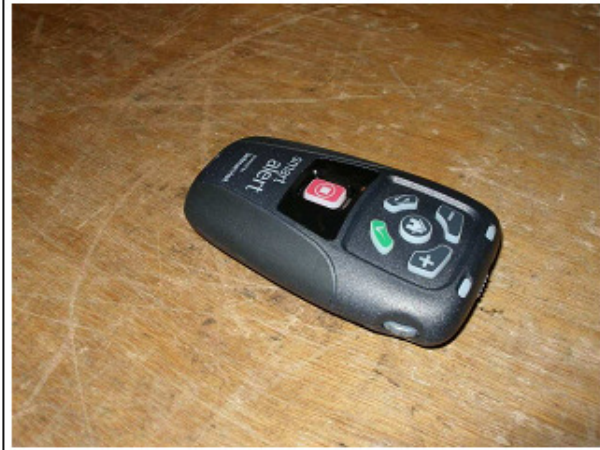
Radiated Emission – Electromagnetic field (1GHz to 2GHz)