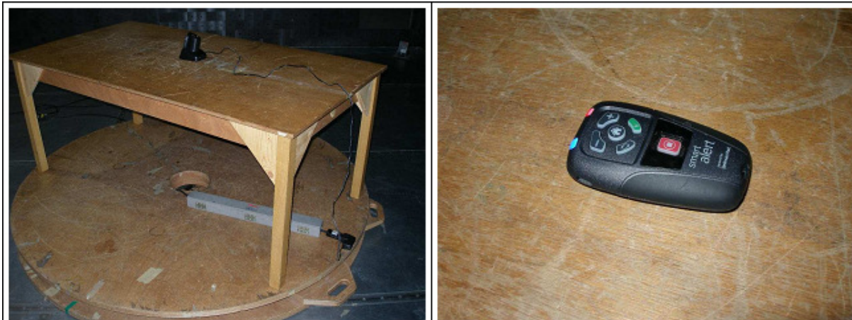
Radiated Emission – Electromagnetic field (30 MHz to 1GHz)