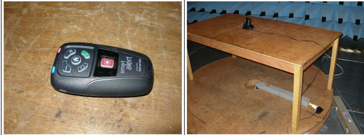
Radiated Emission – Magnetic field