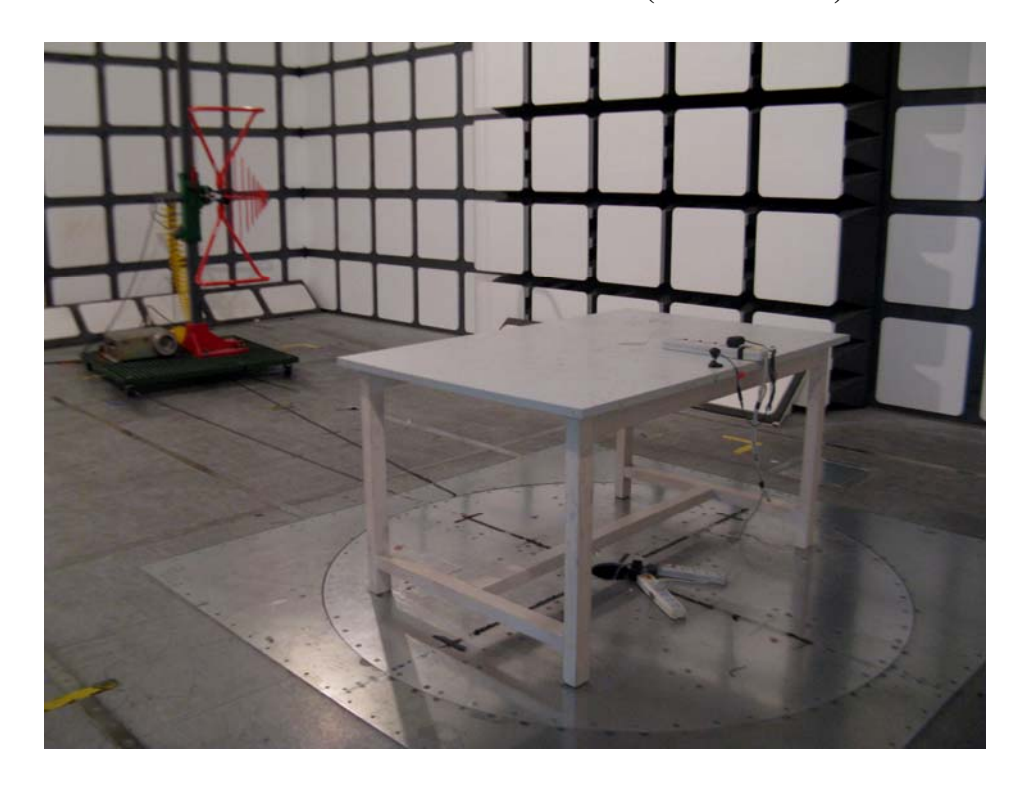
Radiated Emissions - Rear View (Below 1 GHz)