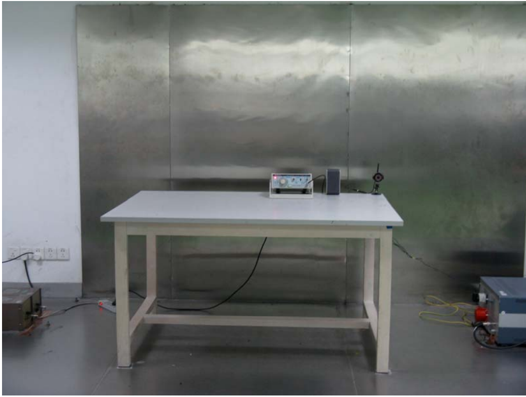
Conduction Emissions - Rear View