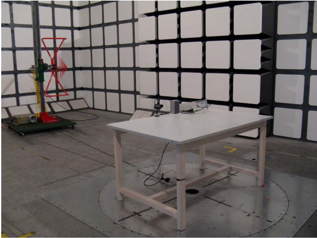
Radiated Emissions - Rear View (30 MHz-1 GHz)