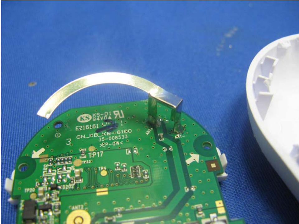
Parent Unit Main PCB solder side (View 1)