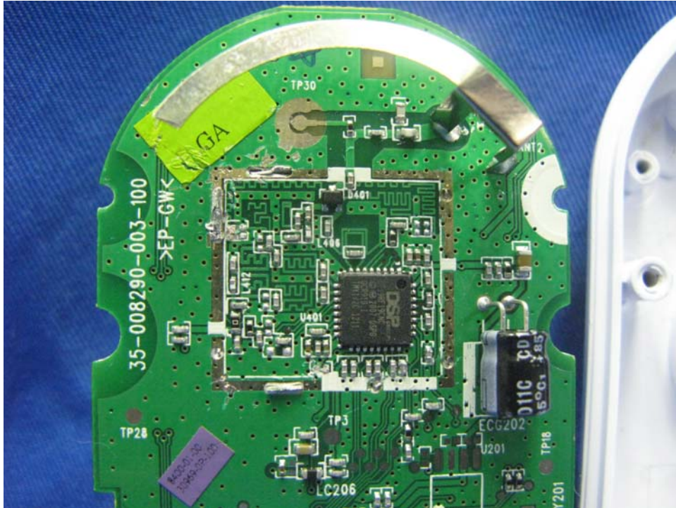
Parent Unit Oscillator PCB comp side