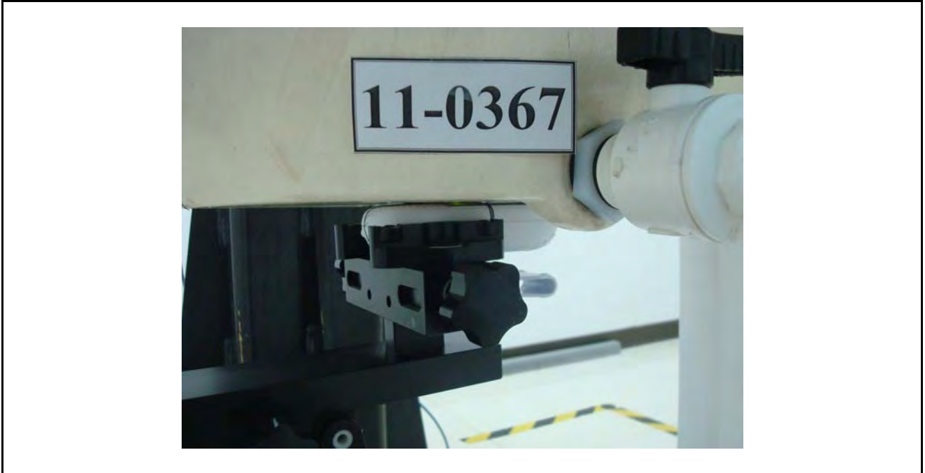
Figure 3. Body SAR Test Setup (Flat Section)