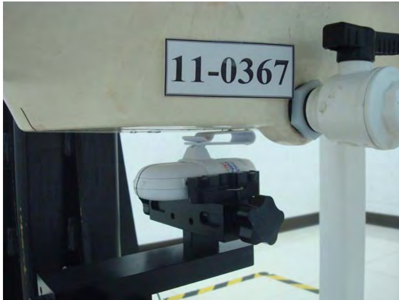
Figure 4. Body SAR Test Setup (Flat Section)