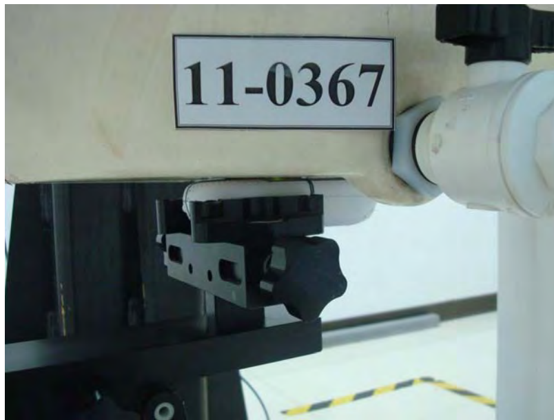
Figure 2. Body SAR Test Setup (Flat Section)