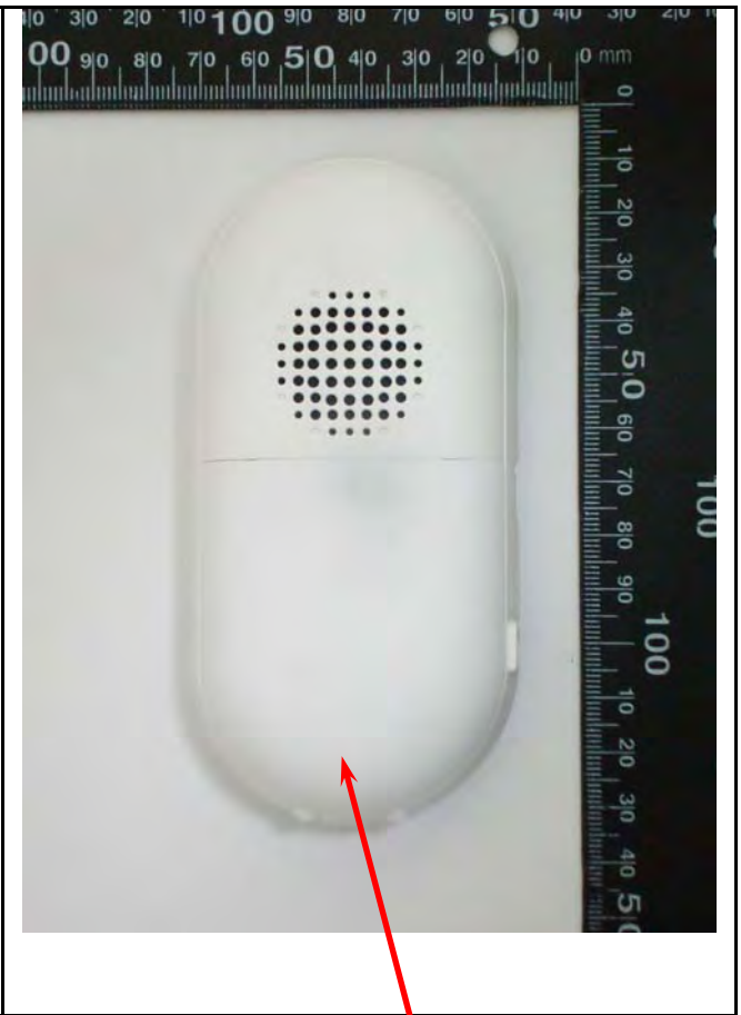
EUT Front side