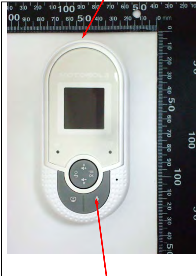
EUT Top side