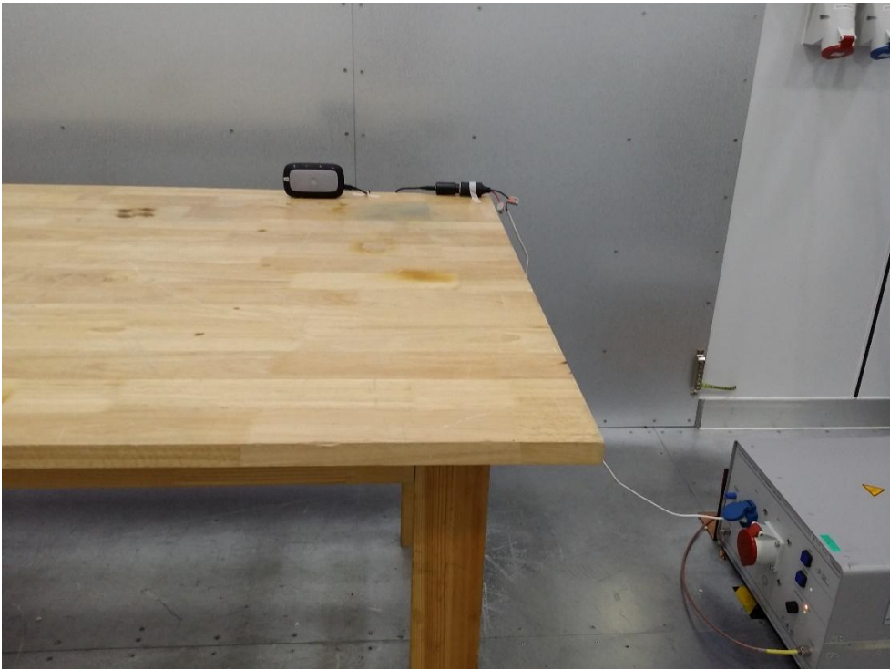
Radiated Emission Test below 1GHz