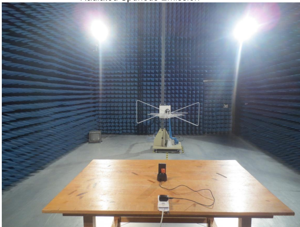
Radiated Spurious Emission