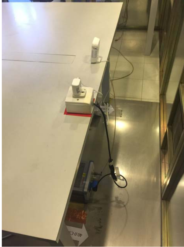
Side View 2