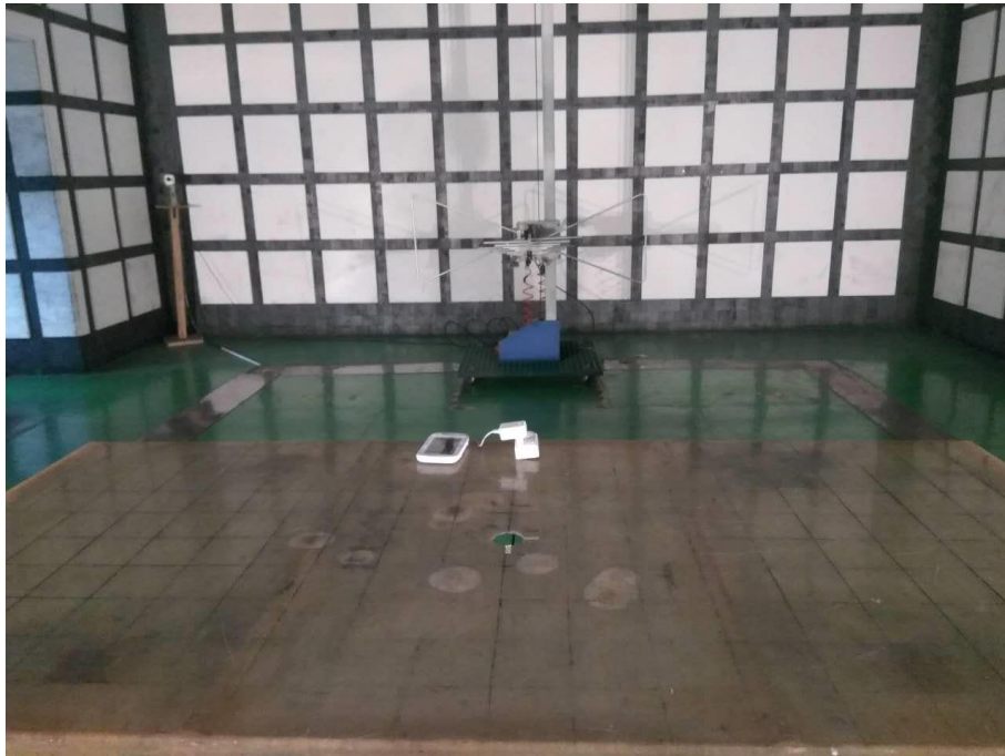
Photograph 6: Set-up for Radiated Emission, Above 1GHz