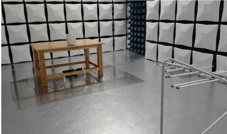
Photograph 6: Set-up for Radiated Emission, Above 1GHz