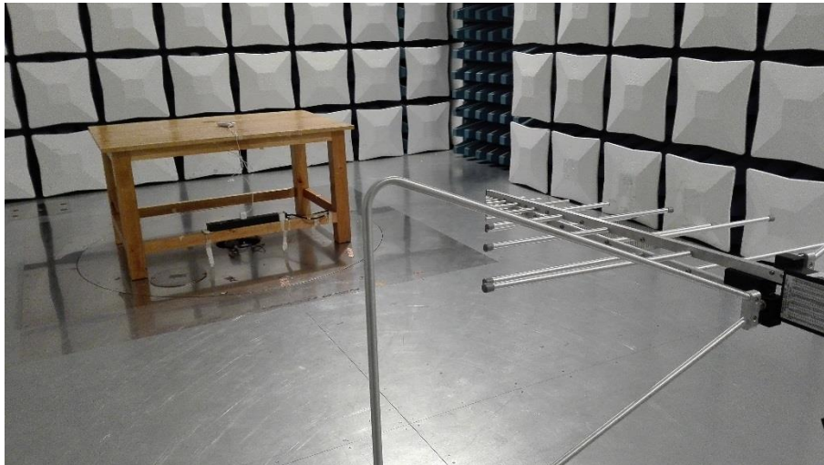
Photograph 6: Set-up for Radiated Emission, Above 1GHz