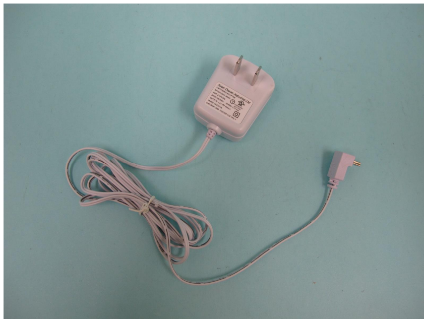
AC/DC Adaptor – S04-003-0050-00600