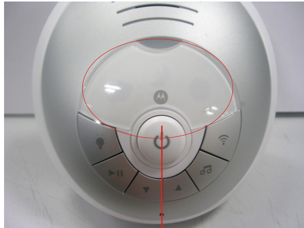
Transparent protective label