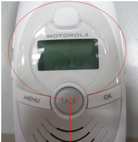
Transparent protective label for Lcd