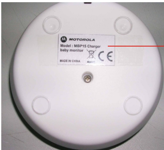
Rating label on charger