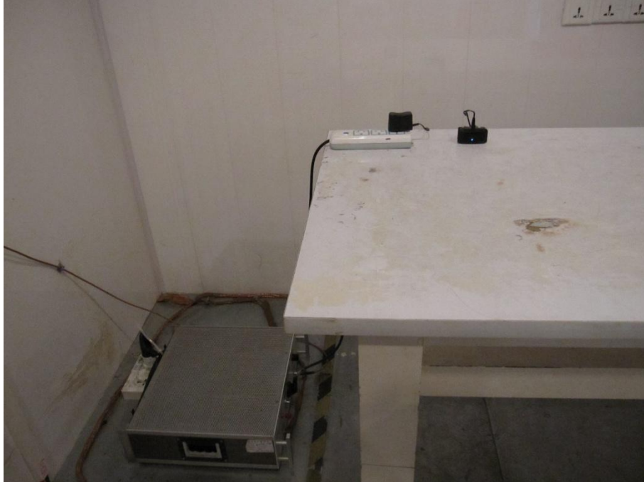
Figure 1 Setup for conducted disturbance