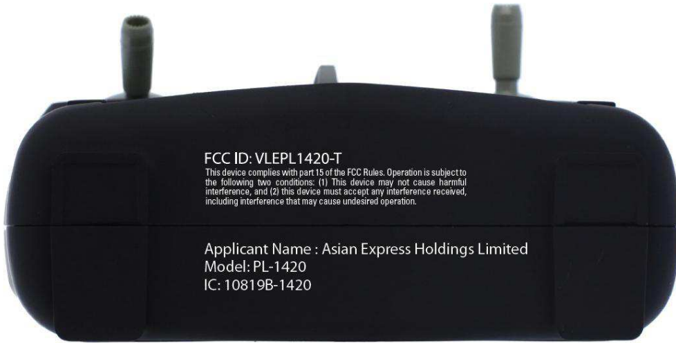
Remote control bottom