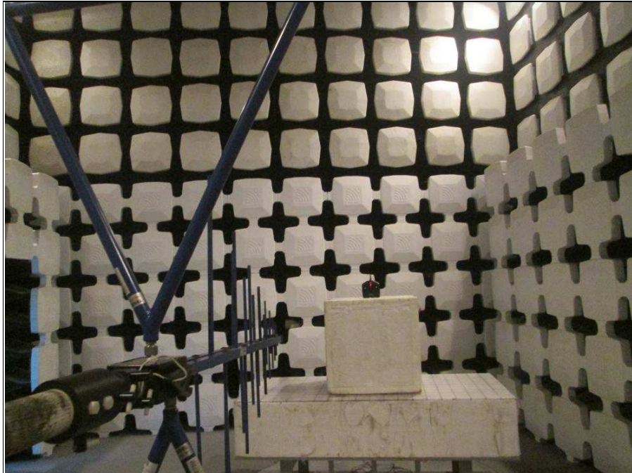
Frequency Range < Above 1GHz >