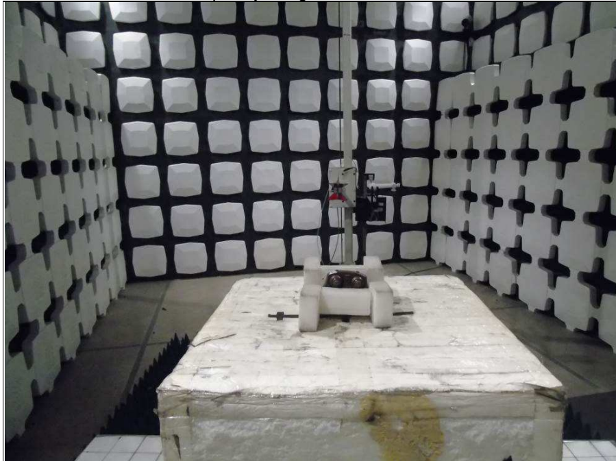
Frequency Range < Above 1GHz >