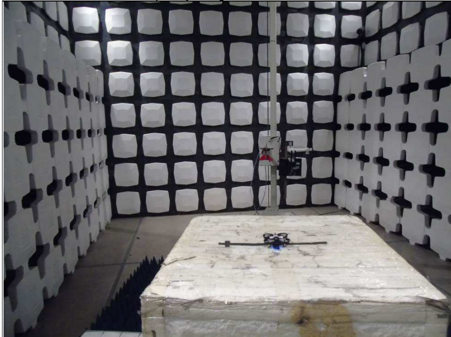
Frequency Range < Above 1GHz >