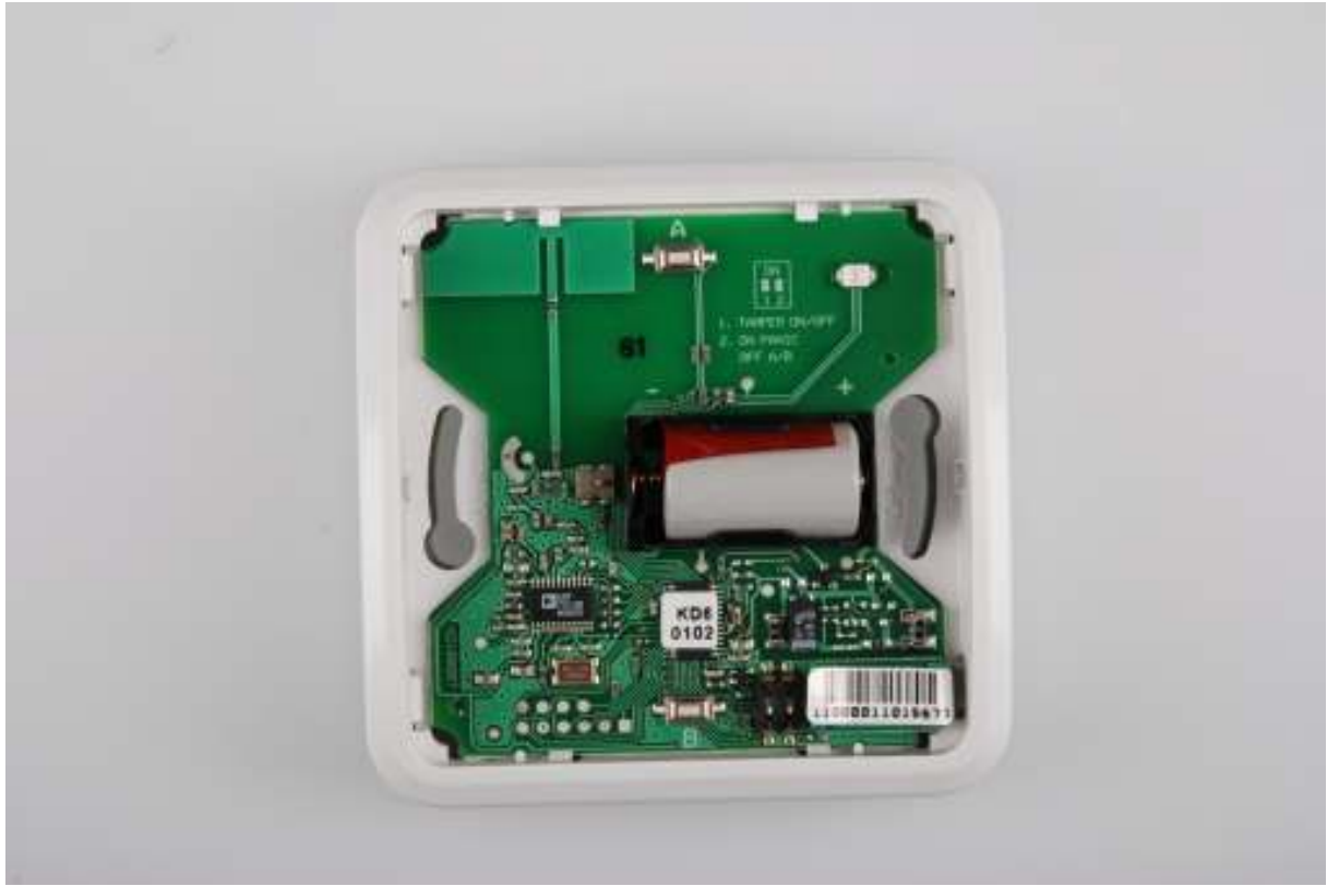
Cover removed – PCB front view