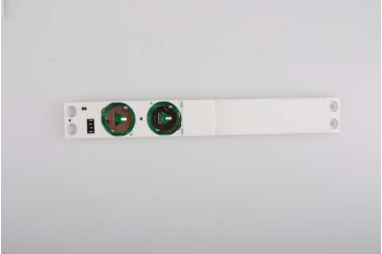
Front view without battery cover