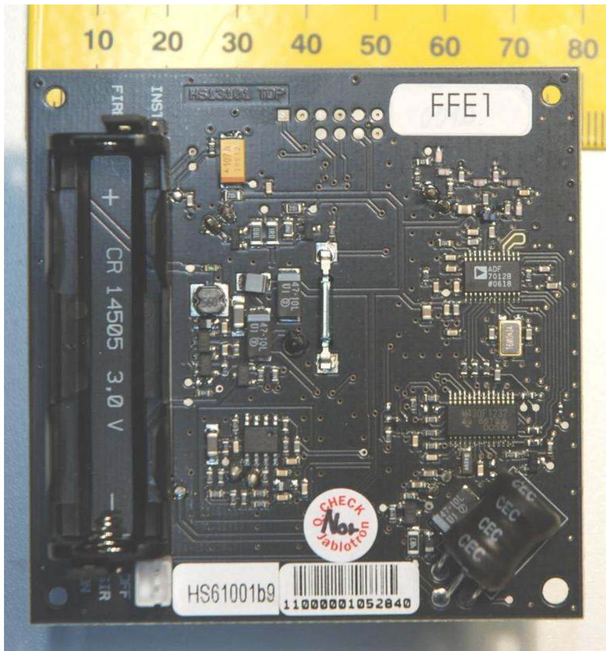
PCB – battery side