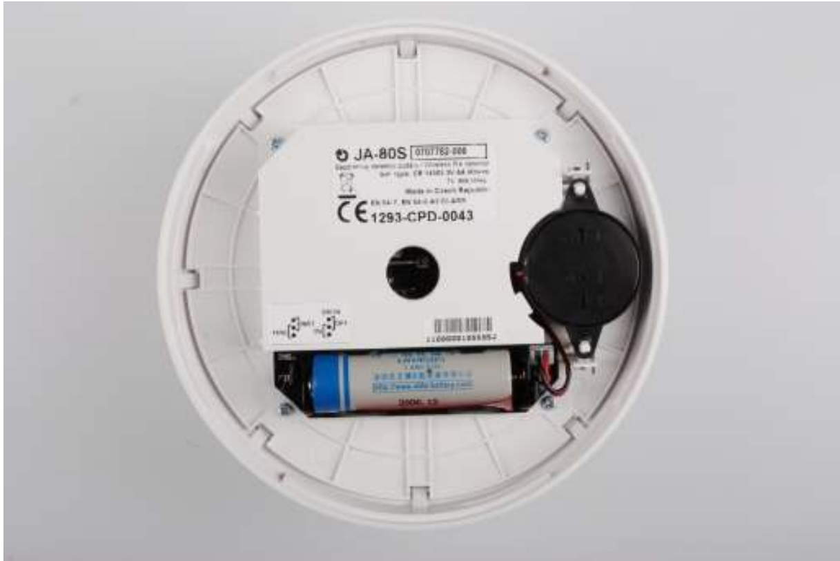
Rear view after cover removal