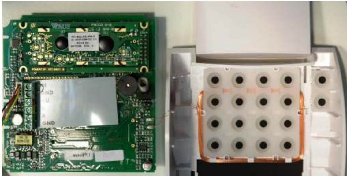
Internal view with antenna – PCB front side