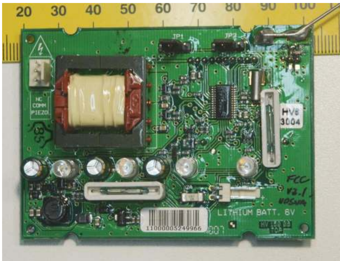
PCB front view