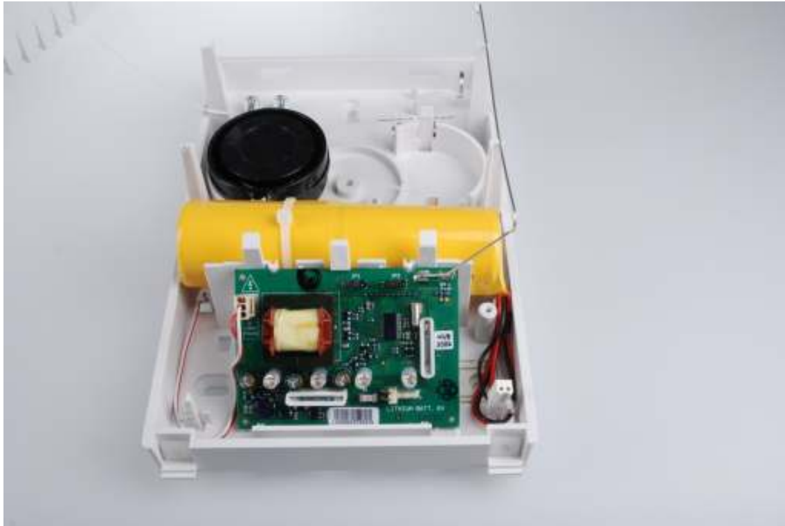
Device in plastic enclosure