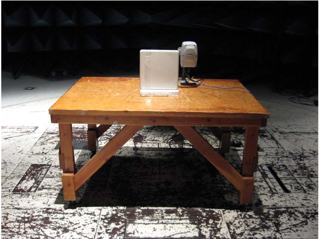
Test Equipment and setup for various Radiated Measurements (Panel Antenna)