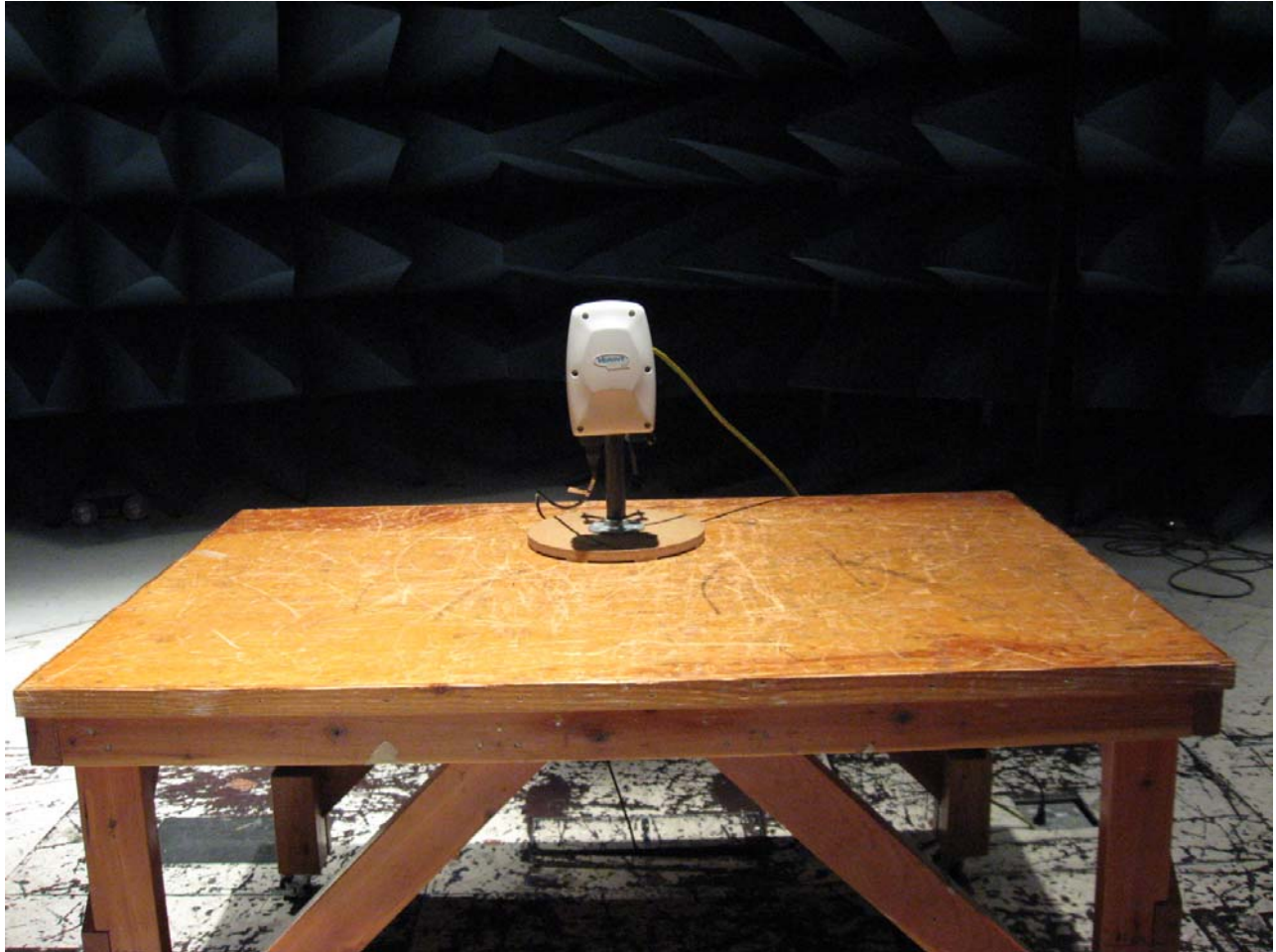
Radiated Emission Test Setup 30 MHz - 1 GHz