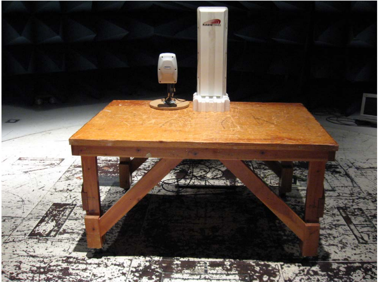
Test Equipment and setup for various Radiated Measurements (Sector Antenna)