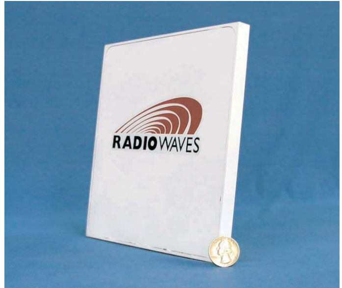
Xcelarator Model FP.5-5-18

The Leader in Microwave Antenna Innovation™