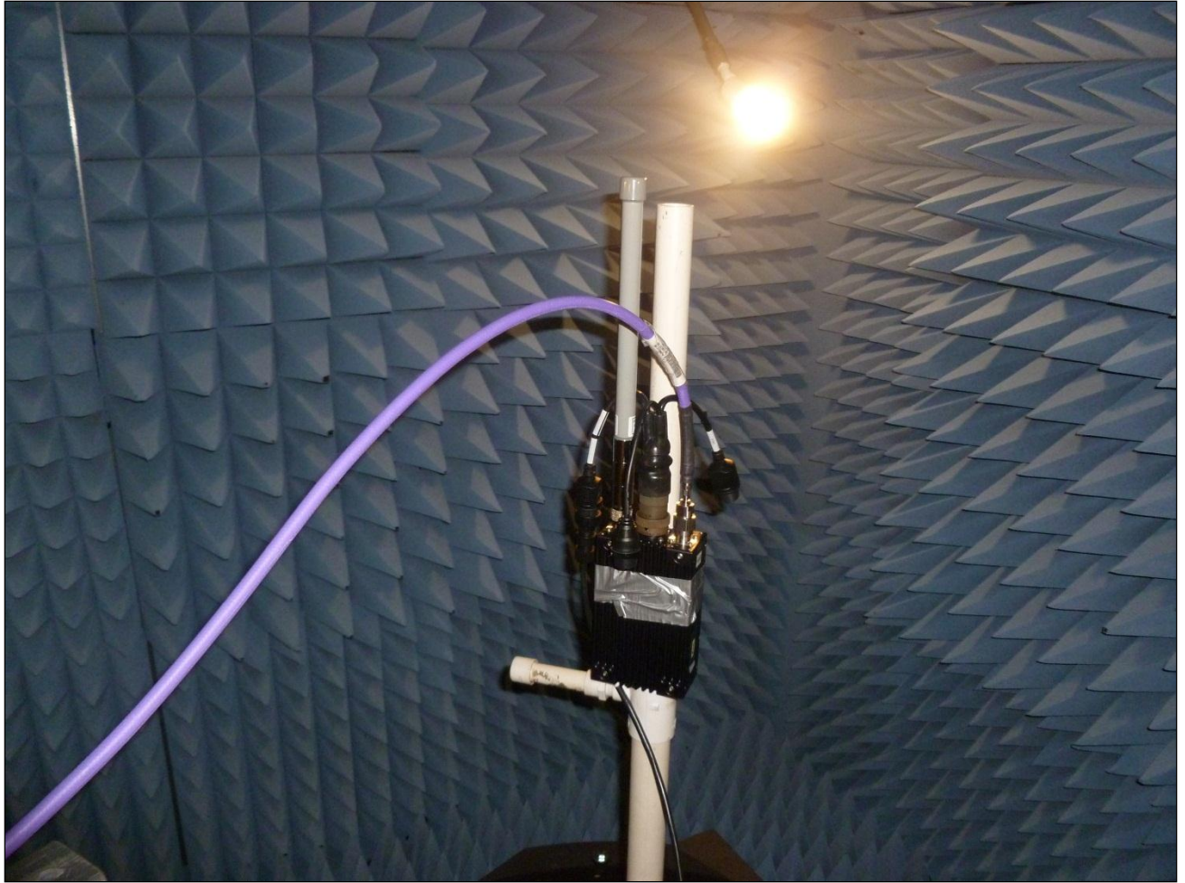
Photograph 4. Peak Power Output, Test Setup