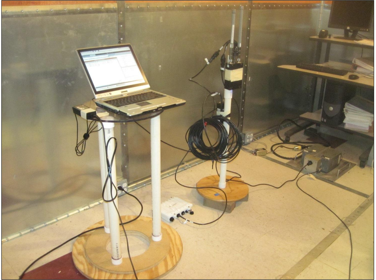
Photograph 3. Conducted Emissions, 15.207(a), Test Setup