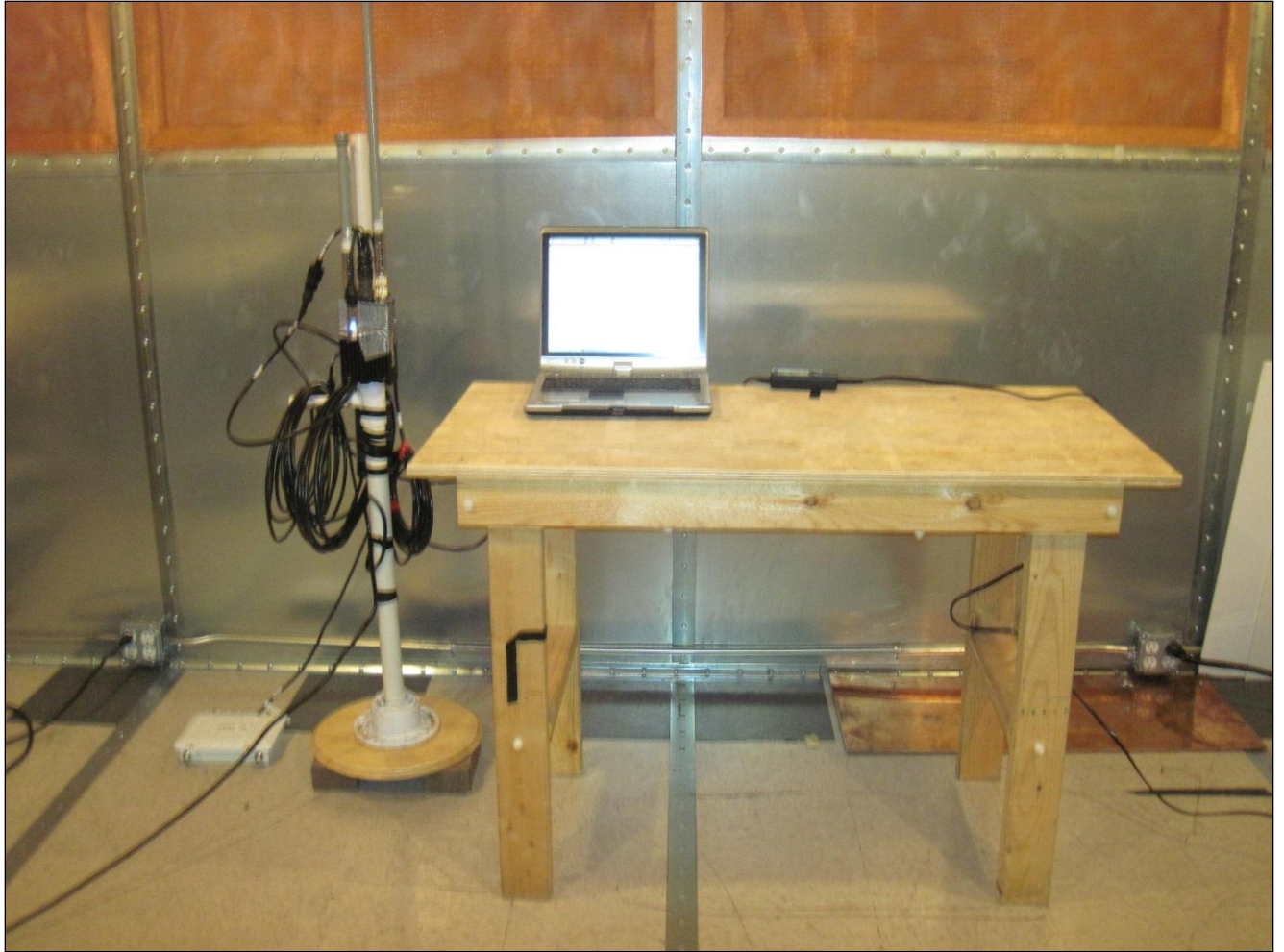
Photograph 1. Conducted Emissions, Test Setup